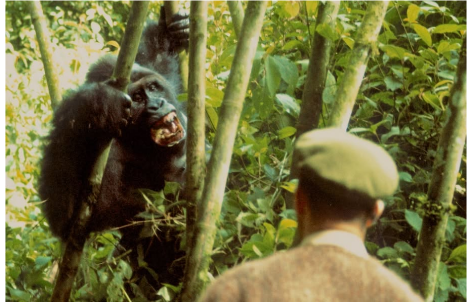
The gorillas in Kahuzi-Biega National park were at first shy and very aggressive! (1972) from my photo essay book "Arks of the forest"